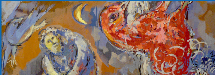
Marc Chagall, The Prophet Jeremiah (detail); woven tapestry, 1973.