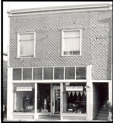
127 E Main St 1960s—C & N Auto Supply Formerly Helf Hardware