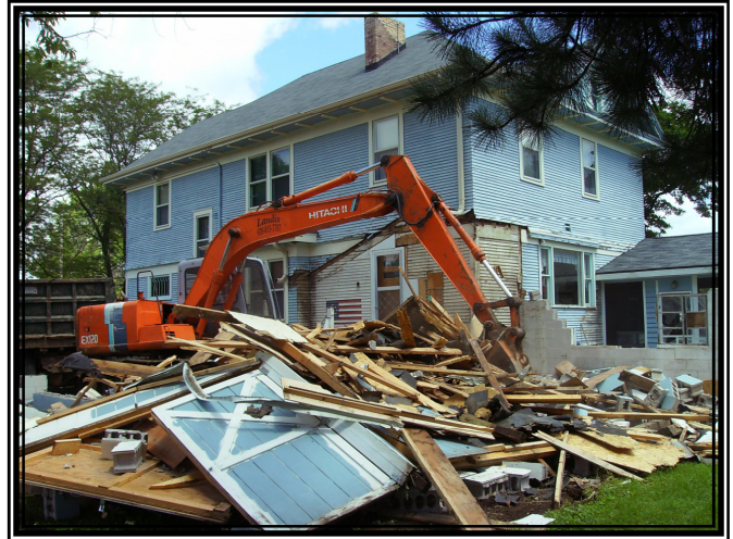
Does this look like a place that needs help?