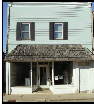
127 E. Main Street Look for a new store coming soon!

“The display window will really draw you in and there's no disappointment in the tasting.”