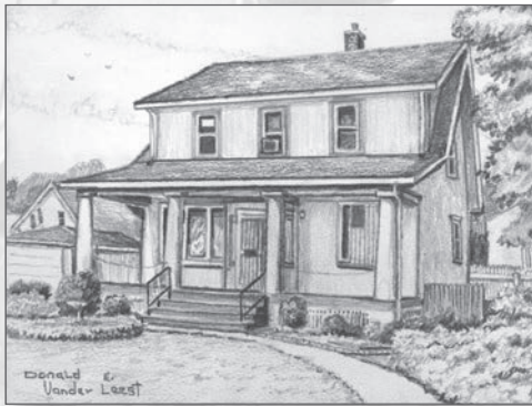
Harvey W. Knoepke House