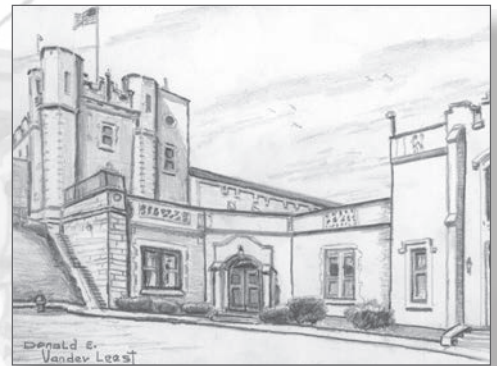
Racine Water Utilities