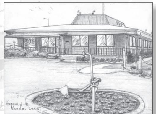
Racine Yacht Club