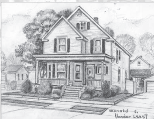
William S. and Helen C. Paul House