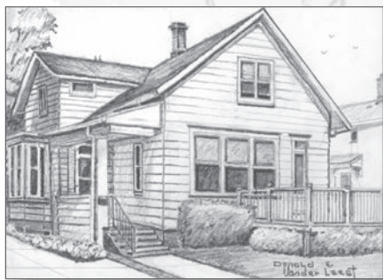
Frederick and Nellie Harter House