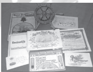
Racine's Boat Building History display by Jim Mercier