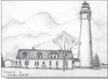
Wind Point Lighthouse Keeper's Residence