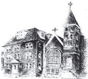
Chippewa County Historical Society